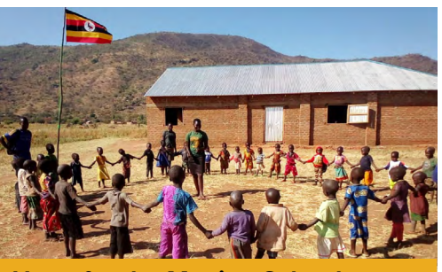
Hope for the Mening School