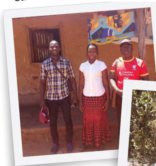
Guinea-Bissau NCM Team